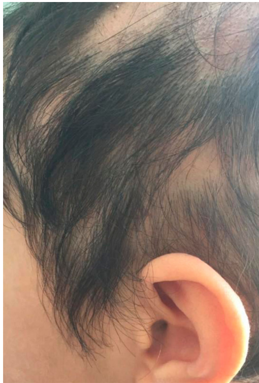
Figure 1. The patient's left temporoparietal region, one month after starting methylphenidate.