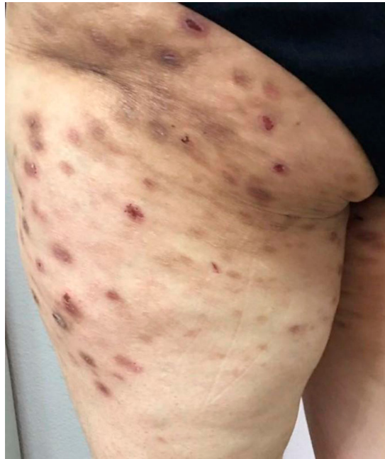
Figure 2. Skin picking lesions on the left upper thigh