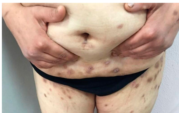
Figure 1. Skin picking lesions on the lower abdomen

Skin-picking disorder; postpartum onset; trauma