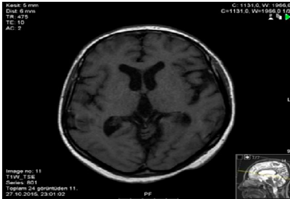
Figure 1. Atrophy in the bilateral frontotemporal regions, secondary dilatation in central CSF fields in MRI of the brain.