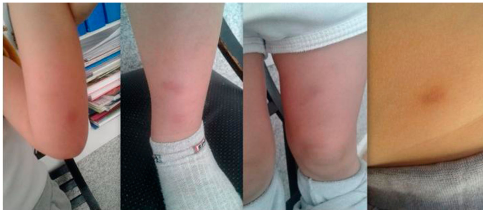
Figure 1. Bruise-like rash on different parts of the body.